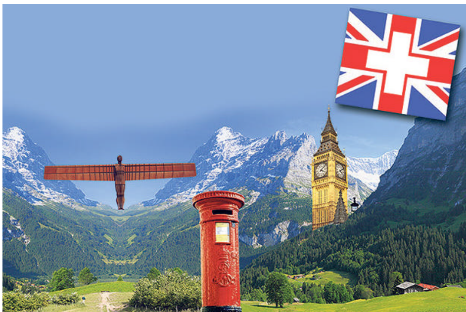
Brits could follow landmark decision of Switzerland